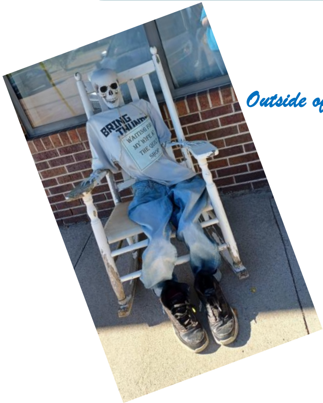
Outside of Quilters Headquarters