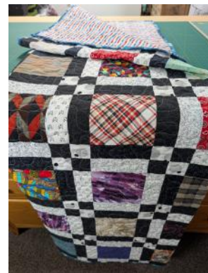
For the young man