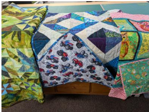
For the family