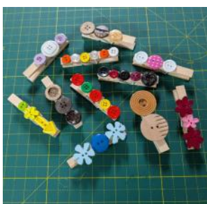
Clothes Pins for Quilt Information Sheets