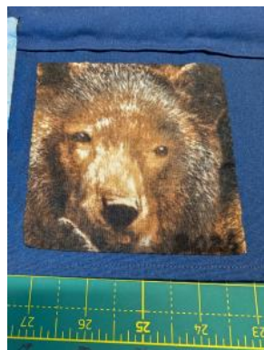
Examples Pot Holder Door prizes